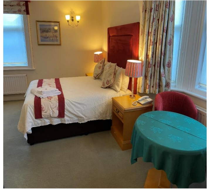
Henry – First Floor