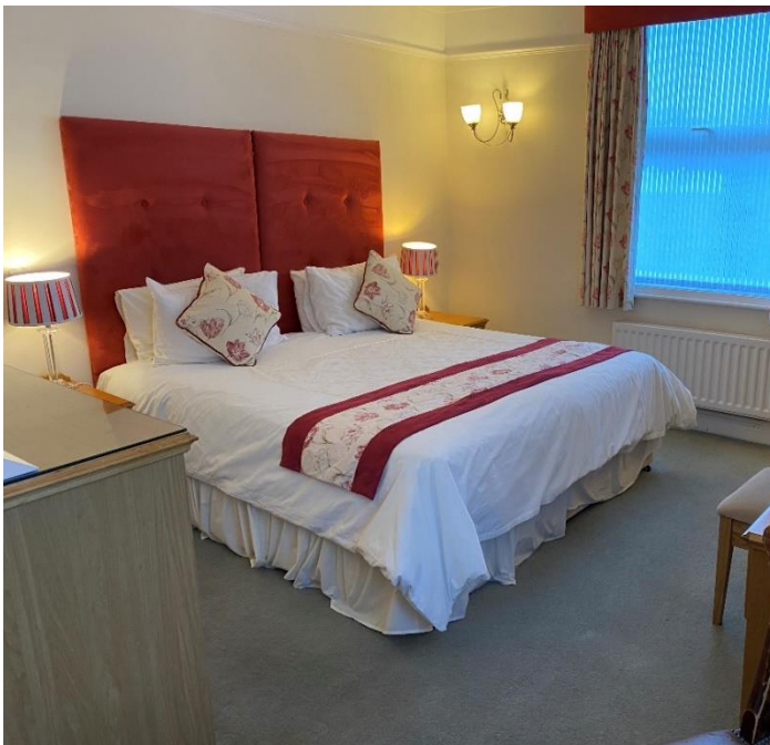
Elizabeth – First Floor