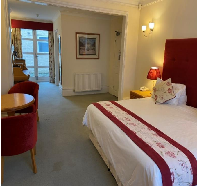
Victoria – Ground Floor