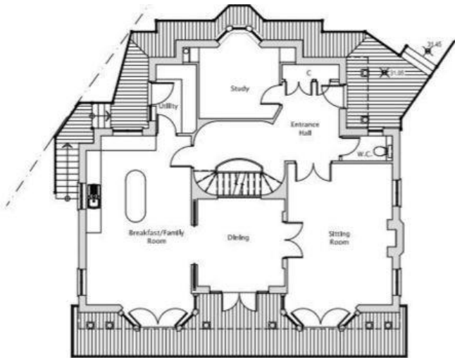
1st (ENTRANCE LEVEL)